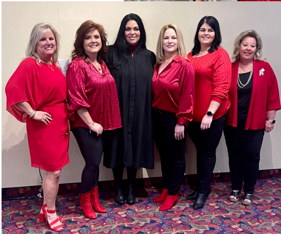
2023 Elected officers sworn in by Judge Billingsley.