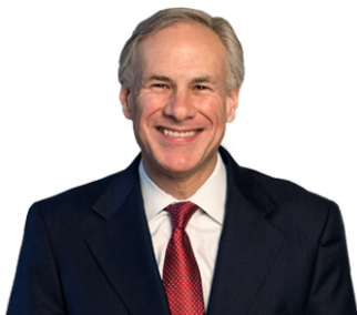
Governor Greg Abbott

Poll watchers, voting clerks and judges for voting locations are needed and most of these are paid positions by the election office. So, think about working an election