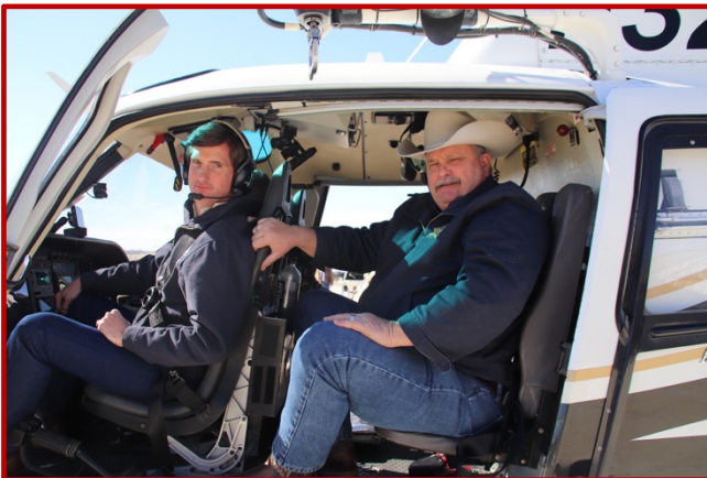
Rep. Brooks Landgraf