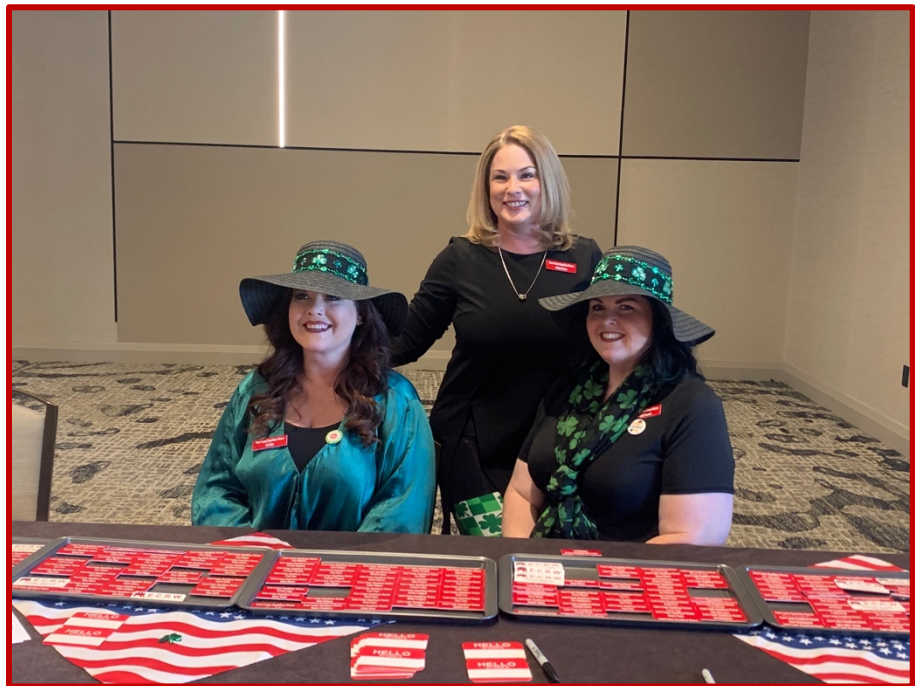
Our lovely "Badge" ladies