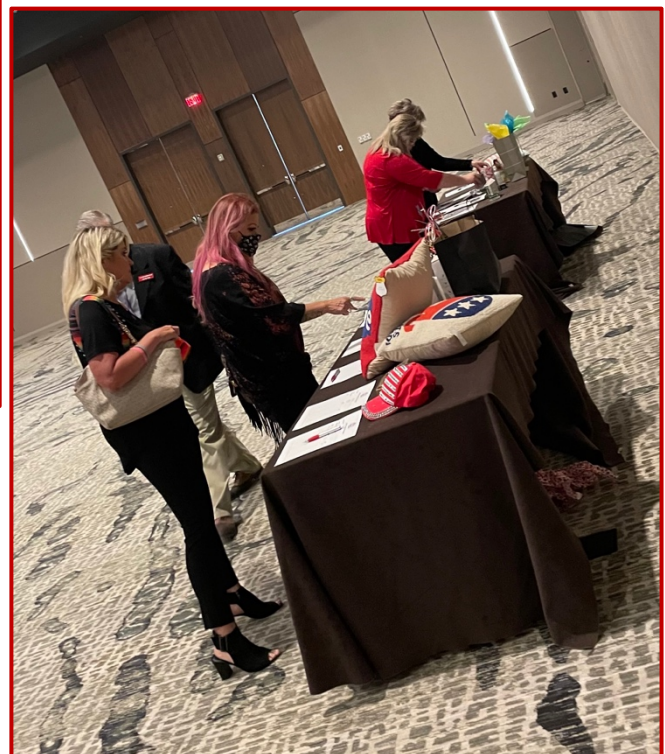
Auction at August luncheon